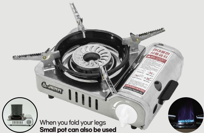
When you fold your legs Small pot can also be used