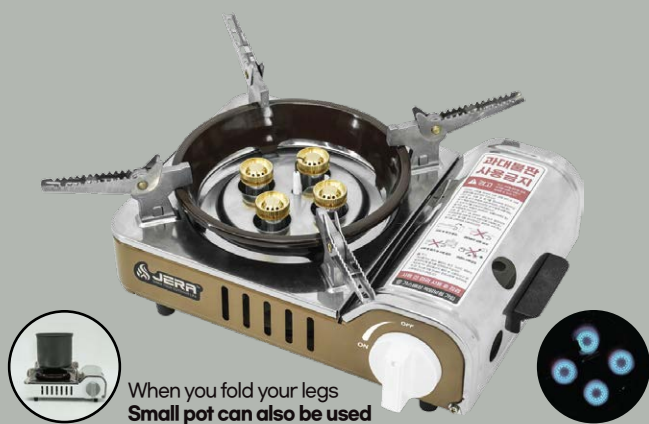
When you fold your legs Small pot can also be used