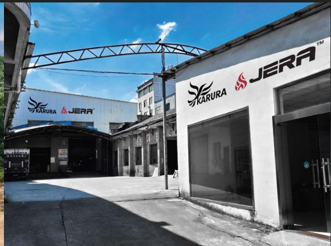
JERA CHINA YONGKANG FACTORY