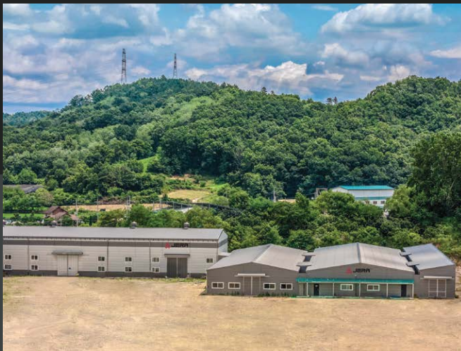
JERA KOREA GEUMSAN FACTORY